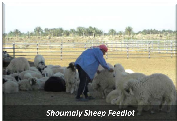
Shoumaly Sheep Feedlot