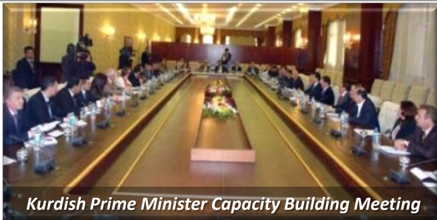
Kurdish Prime Minister Capacity Building Meeting