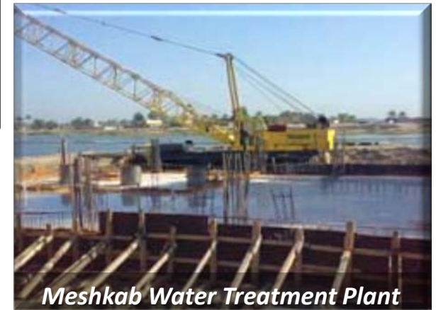
Meshkab Water Treatment Plant