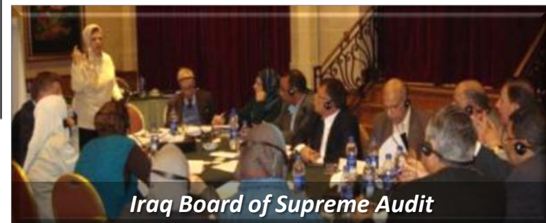
Iraq Board of Supreme Audit