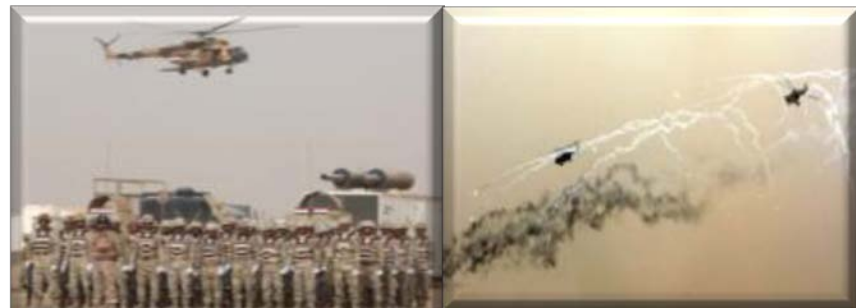
Above: Lion's Leap Training Below: Tadreeb al-Shamil Training

The ISF is now regarded as counterinsurgency (COIN) capable, and the qualified Iraqi trainers necessary for sustaining the IA COIN force are in place.