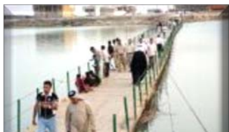
Construction & Infrastructure