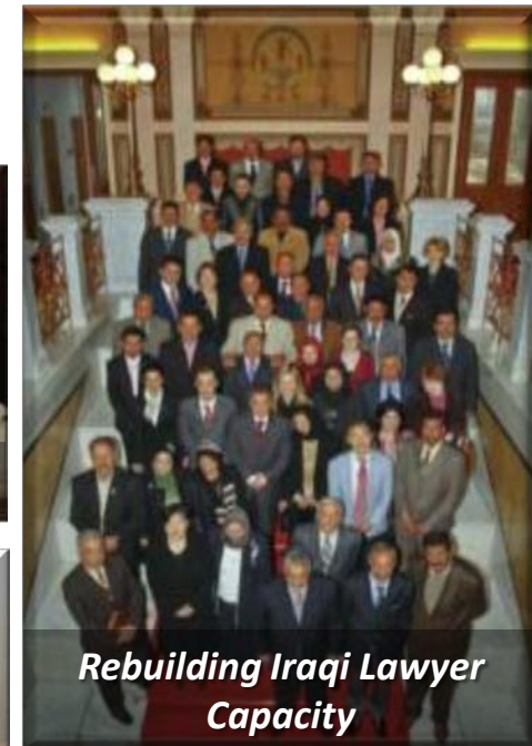
Rebuilding Iraqi Lawyer Capacity