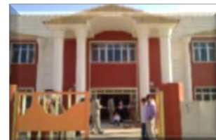
Education and Schools