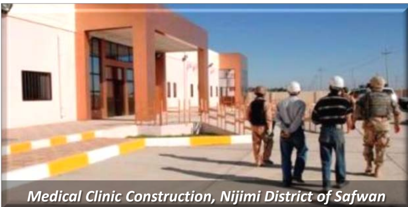
Medical Clinic Construction, Nijimi District of Safwan