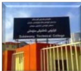
Vocational-Technical and University Exchange