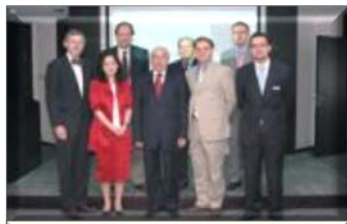
Rule of Law