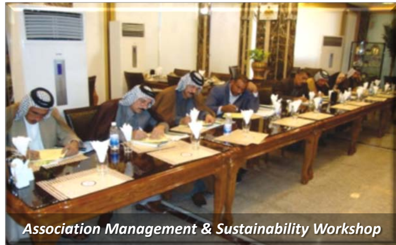
Association Management & Sustainability Workshop