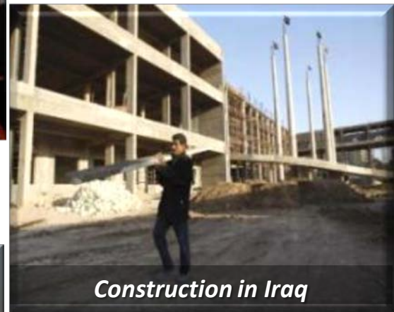
Construction in Iraq