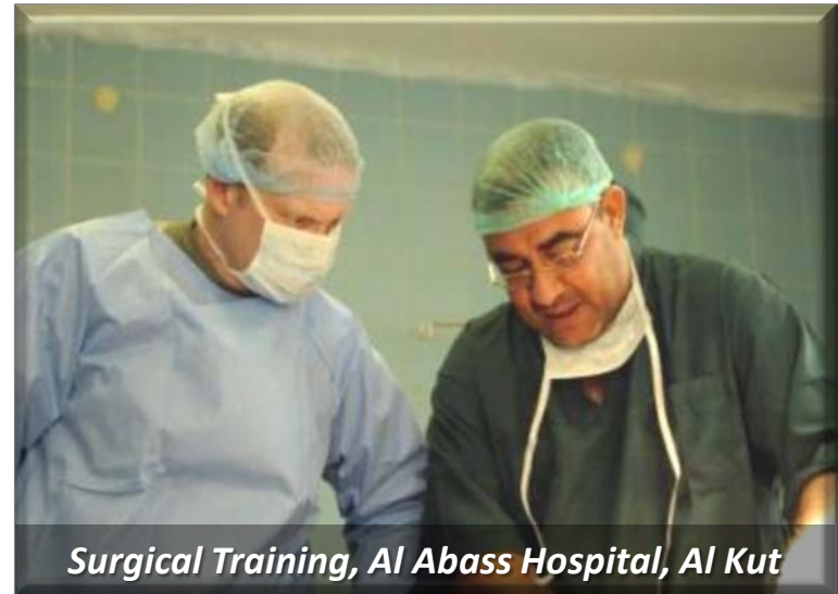
Surgical Training, Al Abass Hospital, Al Kut