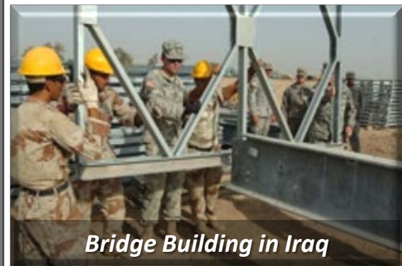
Bridge Building in Iraq