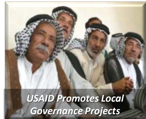
USAID Promotes Local Governance Projects