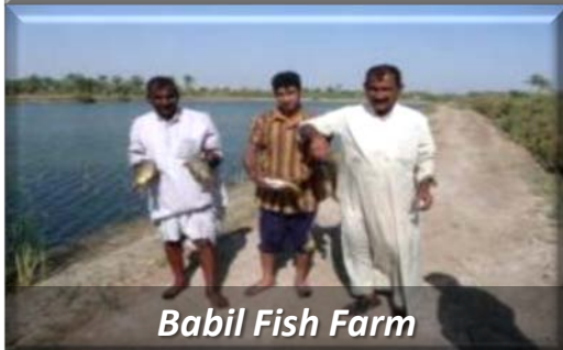
Babil Fish Farm