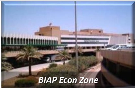
BIAP Econ Zone