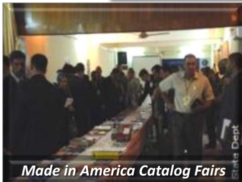
Made in America Catalog Fairs