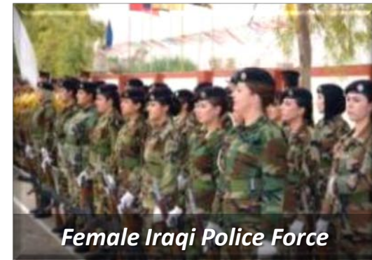
Female Iraqi Police Force

“Human rights and the rule of law are central components of our relationship with Iraq and are key areas for U.S. involvement and support.”