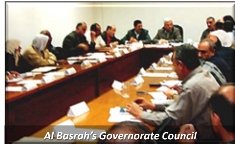
Al Basrah's Governorate Council