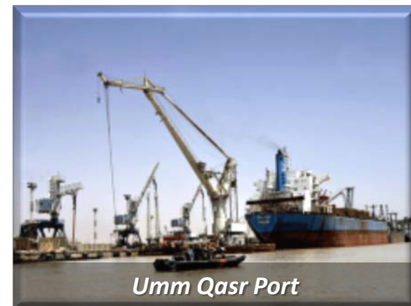
Umm Qasr Port