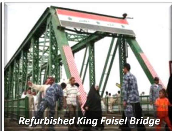
Refurbished King Faisal Bridge