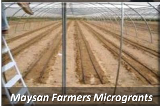
Maysan Farmers Microgrants