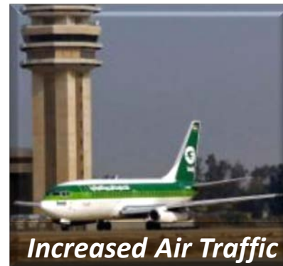
Increased Air Traffic