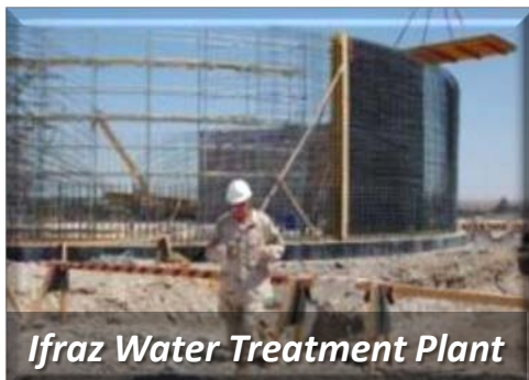
Ifraz Water Treatment Plant