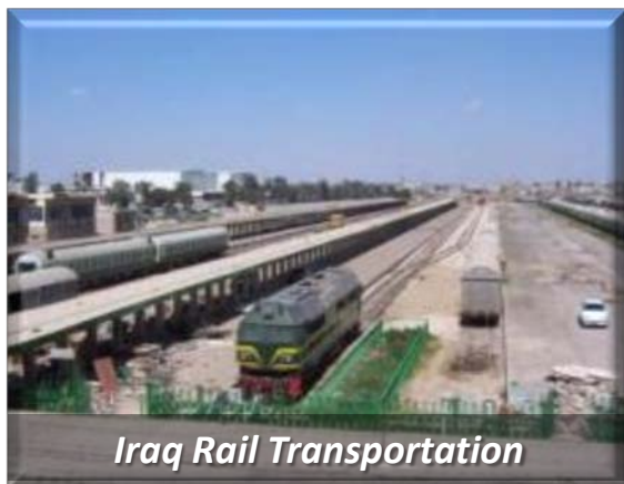
Iraq Rail Transportation