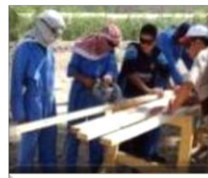
Economy & Business