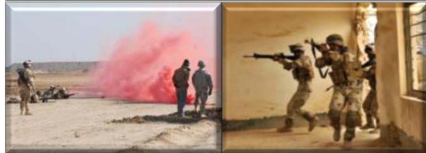
Below: IP recruits conduct three practical exercises during the graduation ceremony demonstrating their proficiency in self-defense