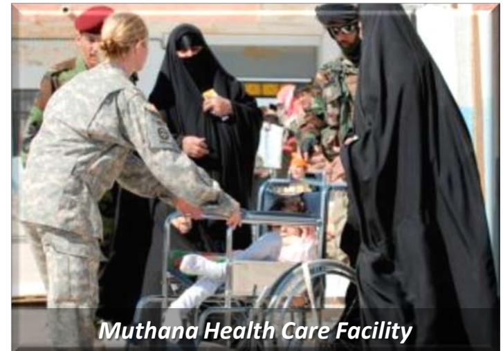
Muthana Health Care Facility