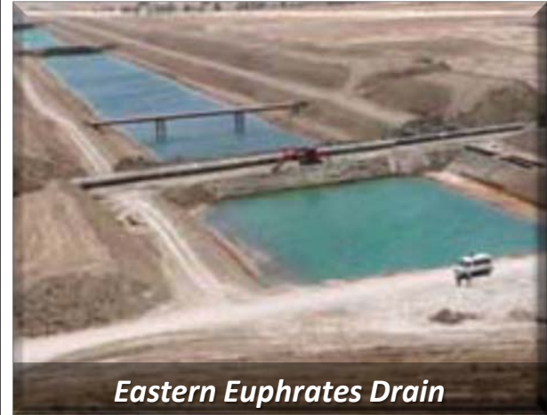
Eastern Euphrates Drain