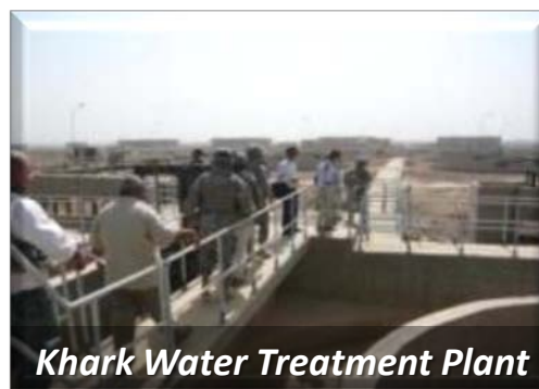
Khark Water Treatment Plant