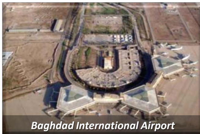
Baghdad International Airport